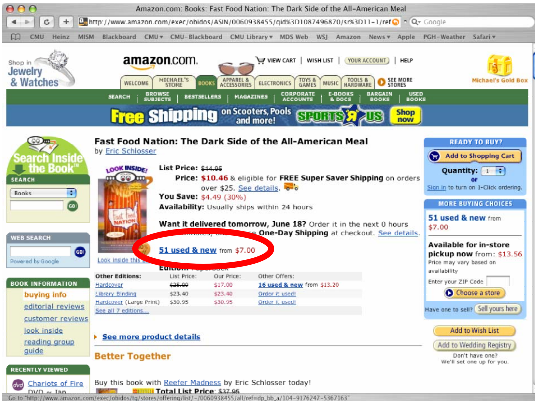
Figure 2: Sample New Book Listing at Amazon.com