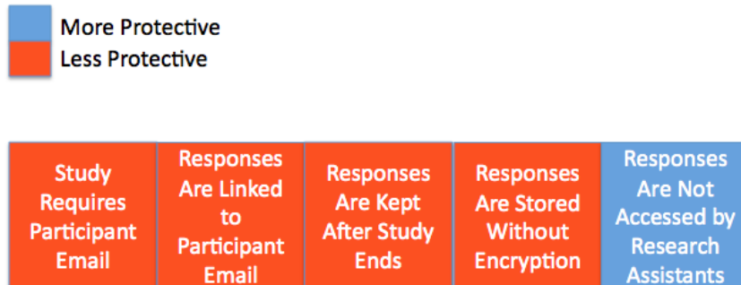
[Figure 1b: High Protection]