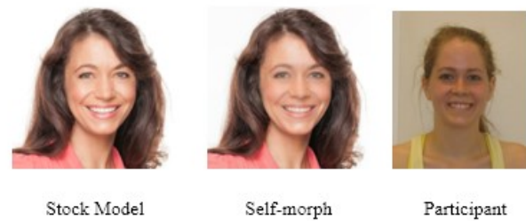
Figure 2. Example stimuli used in Study 2.

Based on the null results of Study 1, we adjusted our estimated effect size to d = 0.25 and aimed at obtaining a larger sample. We calculated that a sample of about 300 would yield a 70% power for a two-sided test, and about 82% for a one-sided test. We thus recruited 310 Caucasian female participants ( M_{age} = 30.76 , SD = 8.7 ) from MTurk who completed the study for a payment of $1.5 each. Participants were asked to imagine that they are looking for a therapist to discuss something going on in their life and they are referred to a specific therapist whose image is displayed. The image of the therapist was, for half of the participants, a self-morph of their own picture with a female stock model's picture (see Figure 2) and for the other half a morph of one of the other participants' image with the same female model's picture.